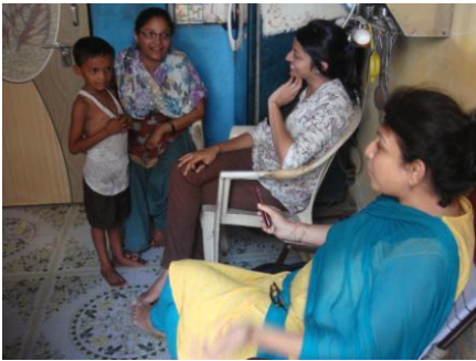
Home visit for all RTE parents from Pre K to Grade 1.