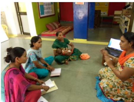
Fortnight updates given to the parents in each grade.