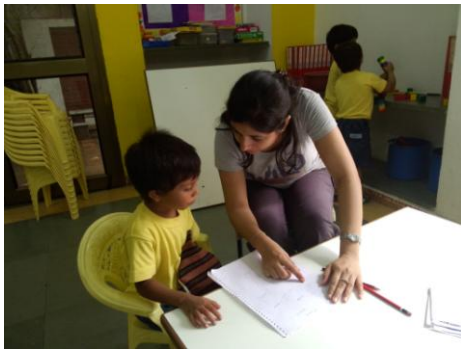
One on One Support Program for students from 12 to 3pm on Wednesdays & Thursdays.

The idea of RTE was welcomed by all three school and we could notice this in the culture of the school right from the Principal to the Support staff