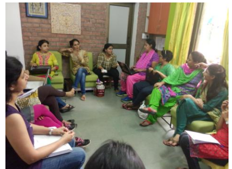
1 st Aug- Team meet for RTE about documentation, updates and growth of each child