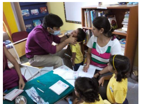
21 July - Medical Check up for all children this included speech and dental check up